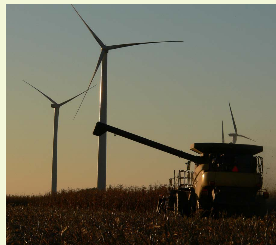
Land Use & Recreation