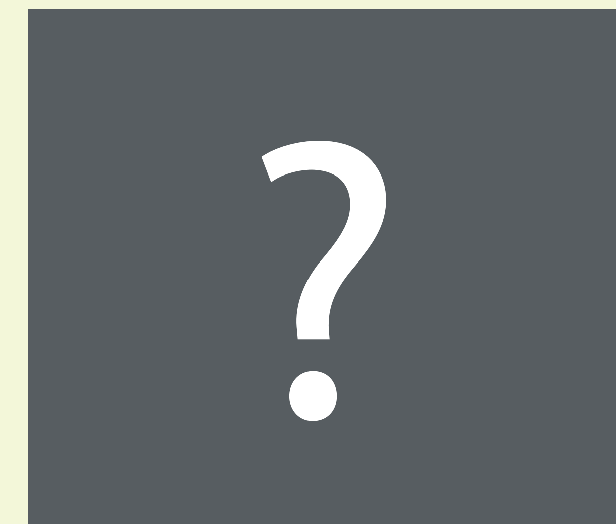
Other Resources Identified Through Scoping