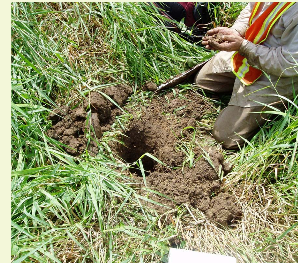
Geology and Soils