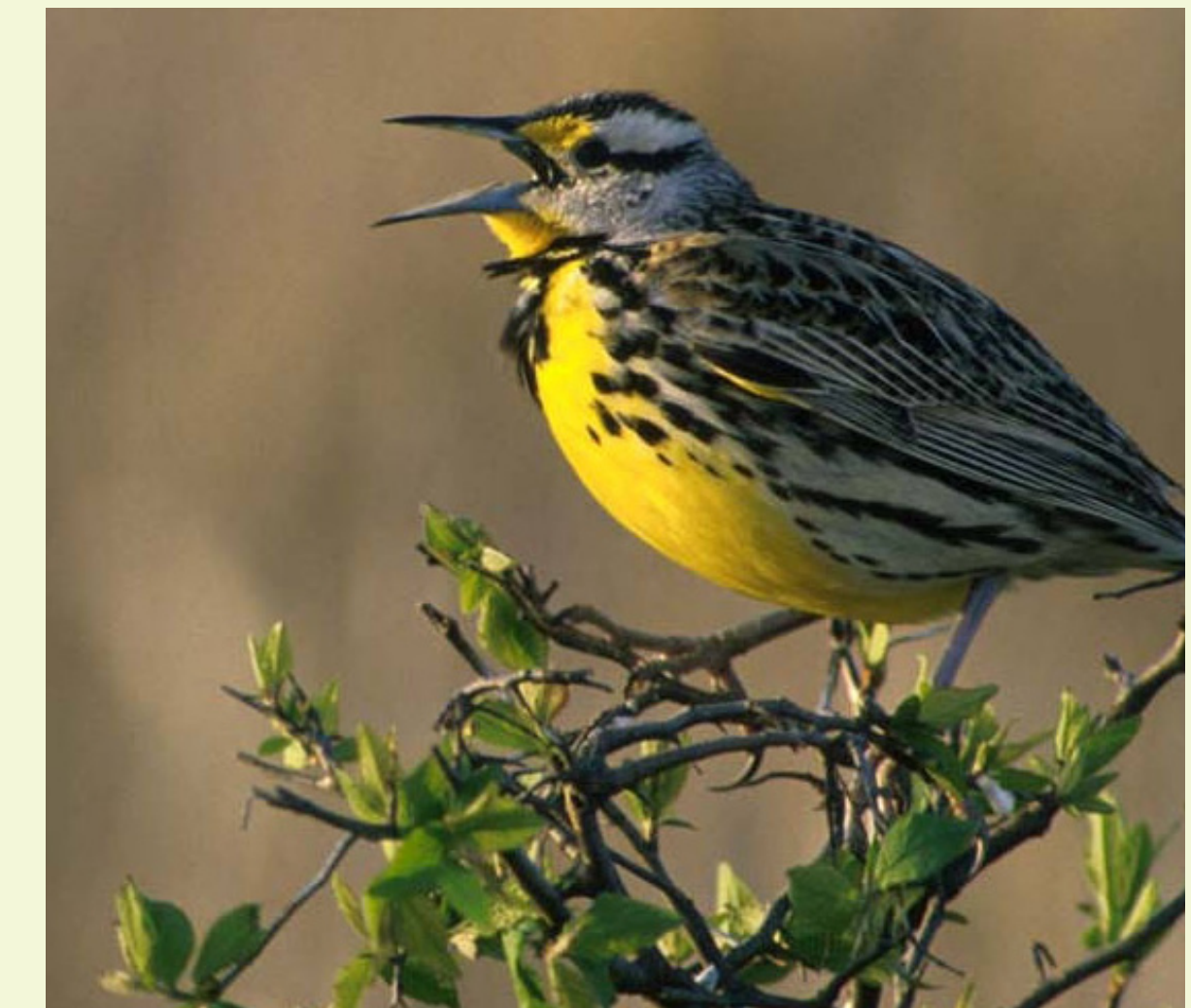
Birds and Bats