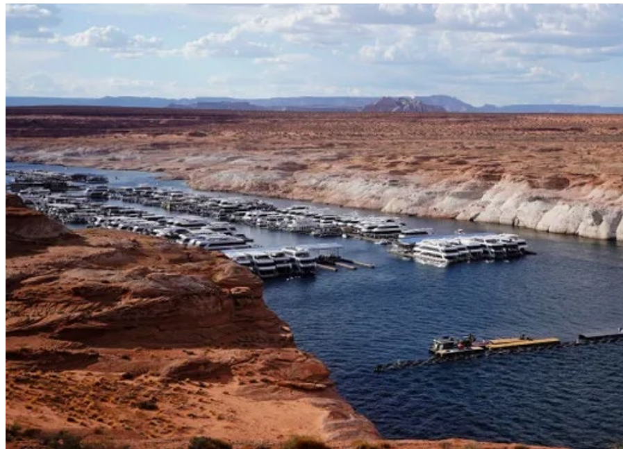
Lake Powell