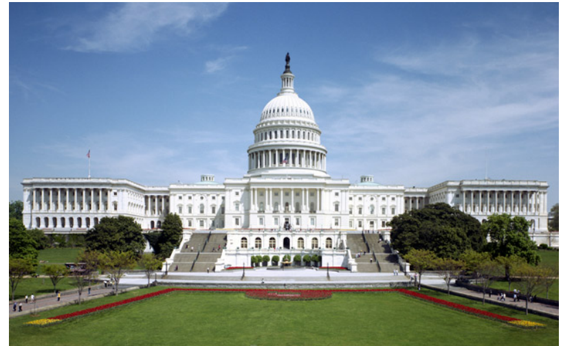
Capitol Hill