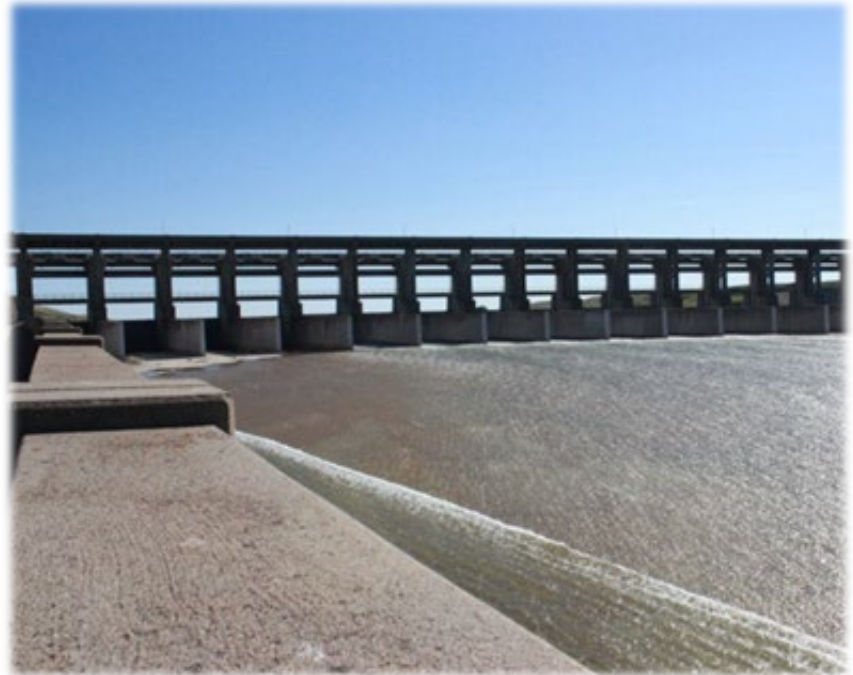
Ft Peck, COE