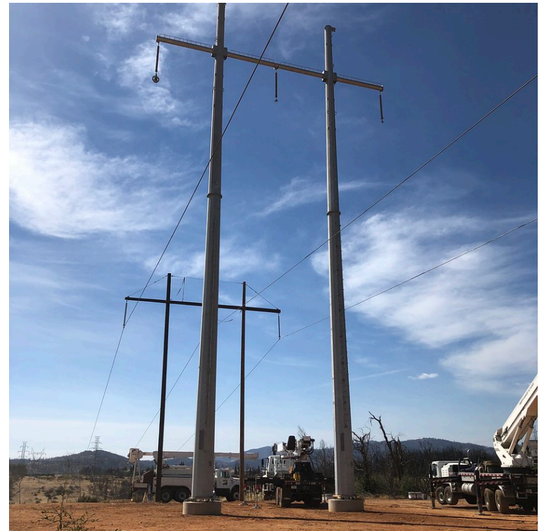
Shasta-to-Cottonwood rebuild, September 2020